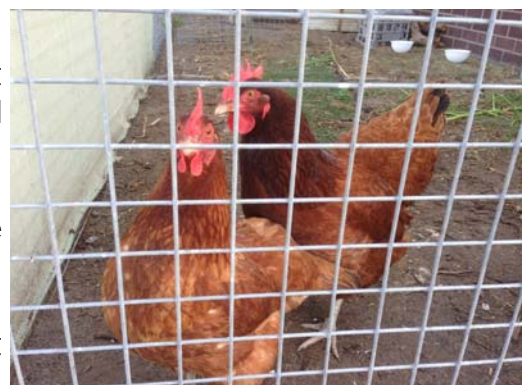
Photo: Two of our three brown chickens in their cage at Jamieson Way campus.

If you are interested please contact Mr Forrester at the College, or on 0401 854 560.